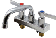
Deck Mt. 6" Extended Spout 4" O.C.