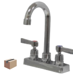
Dipper Well Faucet