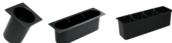
A-19 Single Bottle Rack 5 1/4" x 5 1/4" A-20 3-Pack Bottle Rack (6 Per Carton. Must Order in Qtys. of 6) 5 1/4" x 15 7/8" A-18 4-Pack Bottle Rack 5" x 16 1/2"