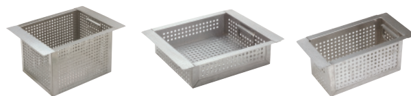
A-16 Fits 10" x 14" x 10" Sink A-17 Fits 9 1/2" x 11 1/2" x 6" Sink A-23 Fits 6" x 11" x 6" Sink A-17A Fits 9" x 9" x 4" Sink