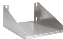
A-24 8" x 8" Add-On Blender Shelf w/ Duplex Outlet Hidden Beneath Shelf